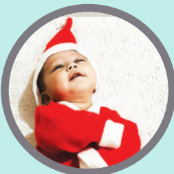
S/o Geetika Tanwar ABS [DEL]