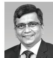
G N Ramaswami Assurance Chennai