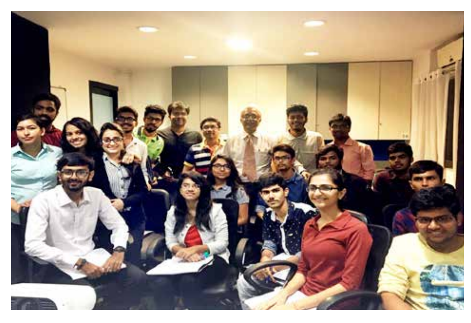
unforgettable experience for all.

Apart from the technical session, there were sessions on soft skills viz, how to speed up your reading- conducted by Girish Sanghvi. Well, the casual riveting games were certainly an