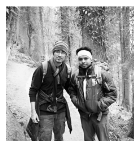
to Delhi. If I have to describe the experience in one word, I would say it was "AWESOME".

Thereafter, it was time for some hard-core adventure. We started our trek in the evening and reached our ultimate destination in the night, the view above us was breath-taking. We slept under the sky full of stars in a tent on a snow covered mountain. The view as I describe, is making me wanting to visit that place again and again. On the next day, the aura of that surrounding was so great that we did not want to return but the trip had to end so we trekked our way back, reached Kasol and did some shopping for our loved ones. Next thing we know is that we are on our way back